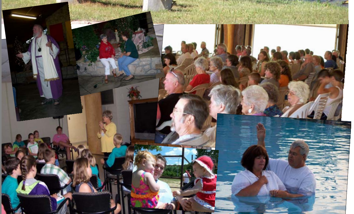
Odessa Congregation enjoys 2006 Family Camp at Lake Doniphan with 54 members attending