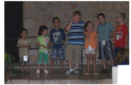
Classes share at Talent Show

Thanks to each one for sharing in our wonderful picnic feast of food and fellowship! Great day!