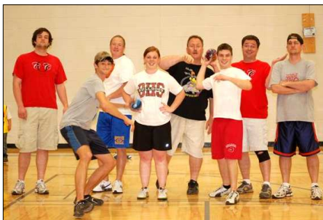
Congregation enters teams in Dodge Ball Tournament at Higginsville

Junior and Jr. High Camps will be separate camps at the same camp grounds (Camp Farwesta).